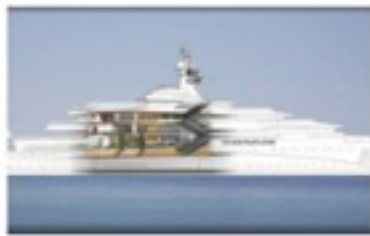
VIA MONTE NAPOLEONE CRUISE SHOPPING